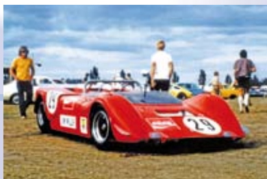
TYPE 350 June 69 Production 1