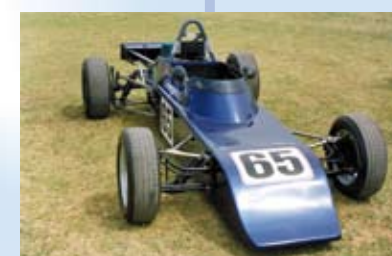
620FF/620B JUNE 72-1975 Production 20