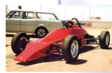
AERO 1979 Production 1