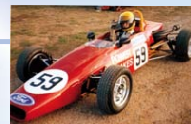
600-FF March 68-72 Production 17