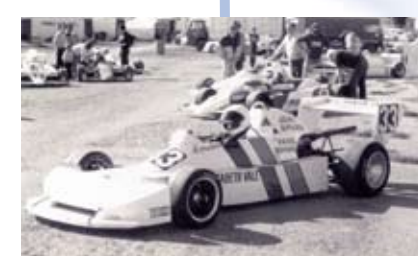
792 January 79-1979 Production 3