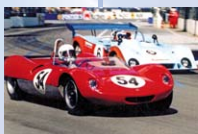
MALLALA December 62-March 64 Production 5