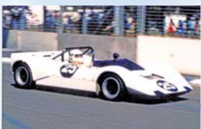
TYPE 300 1967-69 Production 6