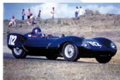
STREAMLINER September 59-63 Production 23