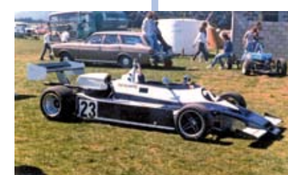
GE Two-25 1980 Production 1