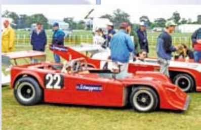
TYPE 360 June 71-1971 Production 3