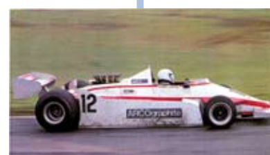
MR 9 1980 Production 1