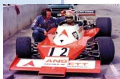
MR 8-C 1976-78 Production 3