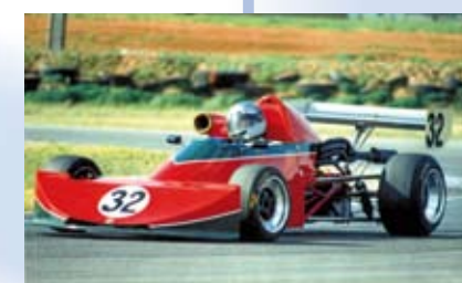
700 1975-77 Production 7