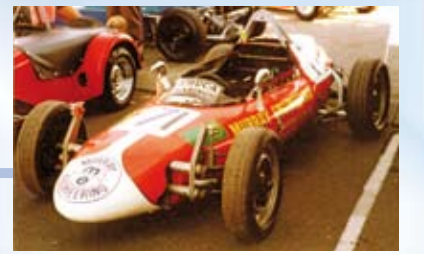
FORMULA Vee December 65-March 68 Production 21