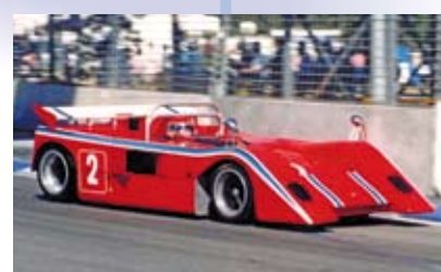
ME 5 October 69 Production 1