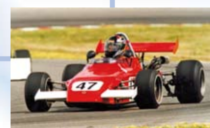
622 October 72-74 Production 6