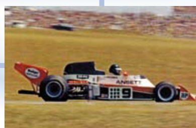
MR 6 1974 Production 1