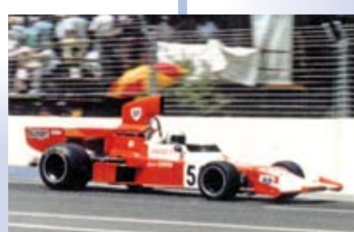
MR 5 Sept 71-Feb 72 Production 4