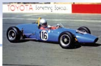
FORMULA Junior / CATALINA 1961-july 64 Production 20