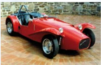
CLUBMAN 1961 - August 65 Production 14