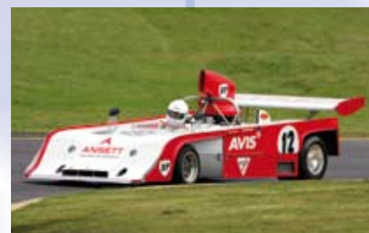
MS 7 1974 Production 1