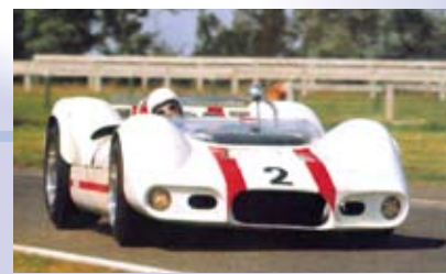
TYPE 400 June 66-67 Production 4