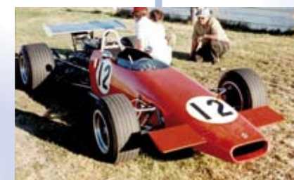
600 March 68-71 Production 27