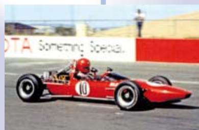
TYPE 100 Mono 1964-1969 Production 19