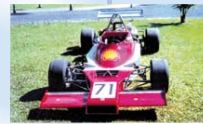
630 1974-75 Production 2